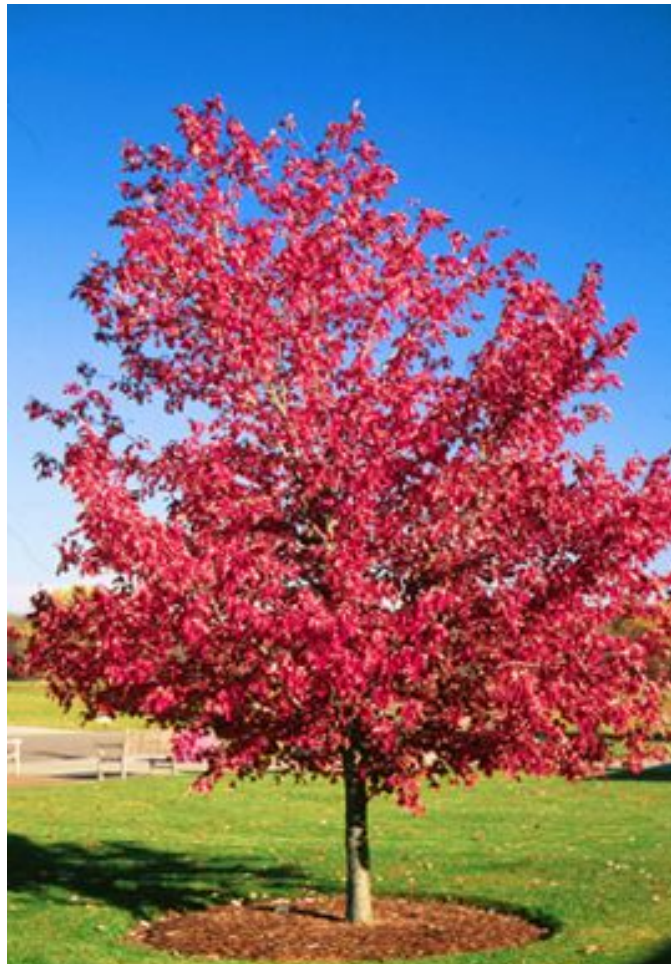
Acer Rubrum – Native Red Maple

We have over 90 acres of trees to choose from at Botanix Oxford Insta-Shade ...and believe it or not, WE PAY YOUR TAX on Saturday, September 22, 2007 , even on trees! The short drive down to Burgessville is well worth the time, the savings, and the remarkable beauty. Make an investment for the future...plant a tree today!